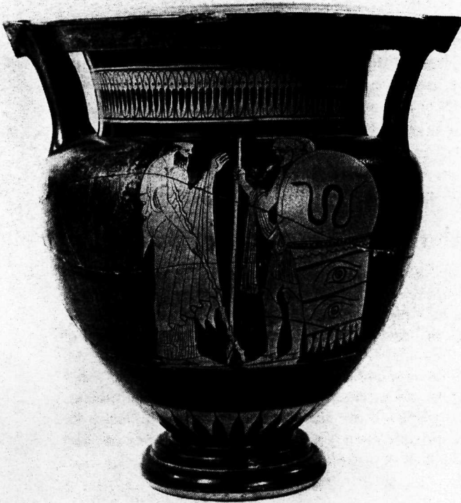
Figure 1.5 Departure scenes were common subjects on many Greek vases. Here a hoplite with shield, greaves, helmet, and spear takes his leave of an elderly man, perhaps his father. Warrior departing. Red-figure column crater, ca. 470 B.C.

The positive side of the hoplite ideal is illustrated in this selection, where the Athenian statesman Solon offers the Lydian king Croesus the case of the Athenian Tellus as the exemplar of the idea that a happy life is one that ends well: Tellus died in battle defending Athens, received from his fellow citizens the honor of a civic funeral, and was survived by sons who would fill his place in the citizen body. 14