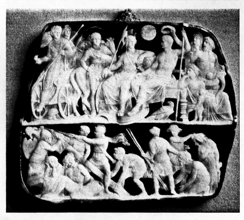
Figure 6. Gemma Augustea.

In the symbolic top register of this cameo, Augustus sits as Jupiter next to the goddess Roma. He is being crowned by Oecumene, the personification of the entire world. On the left, Tiberius descends from the chariot while Germanicus stands armed next to Roma. On the ground to the right are the personifications of Italy and the Roman eagle. Above Augustus the solar disk completes the cosmic order, smiling on the emperor. The lower register portrays Roman troops and subjugated barbarians. Kunsthistorisches Museum, Vienna .