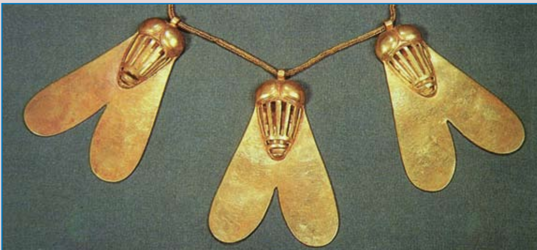
FIGURE 16 Gold flies of valour, a decoration of the early New Kingdom this necklace was found in the tomb of Ahhotep (the Younger)

Ahmose son of Ebana was one of the most decorated soldiers of the early New Kingdom. His family, loyal followers of the Theban princes, came from ElKab, an important centre of support for the new dynasty. His father had served under Seqenenre of the late 17th Dynasty. In the following source he proudly records each of his major promotions under the pharaohs whom he served.