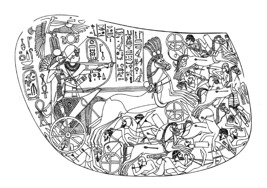
FIGURE 22 Thutmose IV in his

Using Figures 21 and 22 and Source 18, write a paragraph explaining the importance of the 'warrior pharaoh' image in this period.