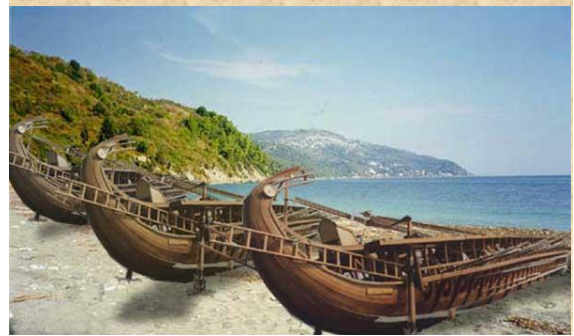
Persian triremes at Marathon (computer simulation)