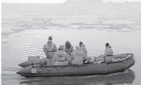
Researchers from the R/V Gould working off Antarctica.