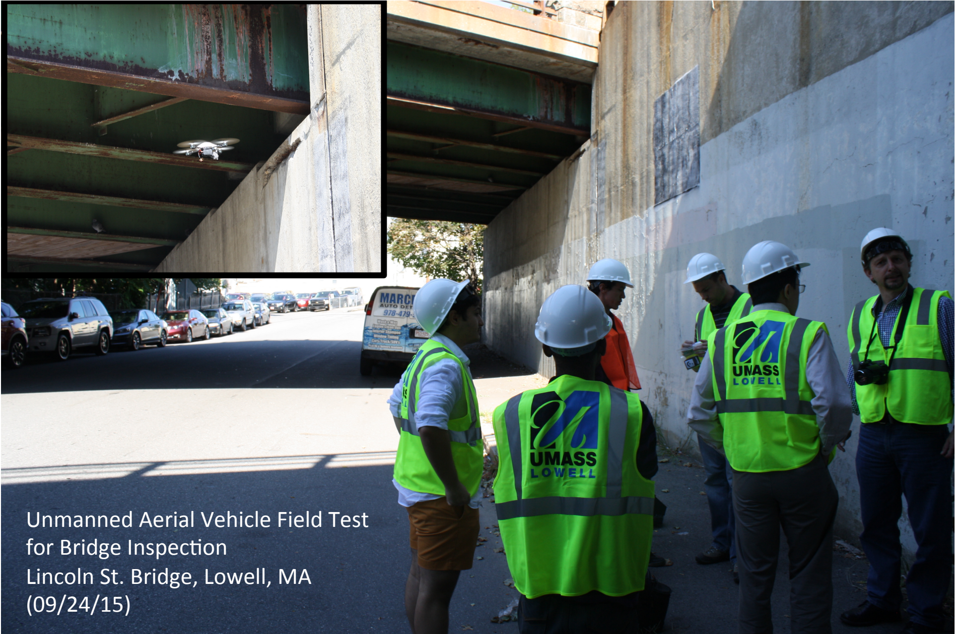
Unmanned Aerial Vehicle Field Test for Bridge Inspection Lincoln St. Bridge, Lowell, MA (09/24/15)