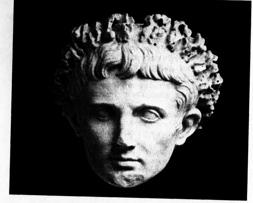
Figure 4. Augustus with Crown.

After a year spent settling Antony's former territories in the East, the new leader returned to Rome in 29 BCE to celebrate his triumph (Figure 4). It was actually a triple triumph for victories in Illyricum, at Actium, and in Egypt. There was a great public spectacle, with an effigy of Cleopatra that was carried through the streets in the ceremonial procession to the Capitoline Hill , the political and religious focus of Rome. Octavian gave 400 sesterces apiece to a quarter million Roman plebeians (or plebs ). The celebrations even included the closing of the gates of the Temple of Janus, which were only closed when the Romans were completely at peace. They had not been closed for more than two hundred years.