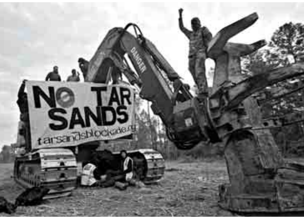
Activists with the Tar Sands Blockade lock themselves to equipment used to build the Keystone XL pipeline near Nacogdoches, Texas, in 2012.

As the great abolitionist Frederick Douglass said, “Power concedes nothing without a demand. It never did and it never will.” What the climate justice movement is demanding is the ultimate abolition of fossil fuels. And our fates all depend on whether they succeed.