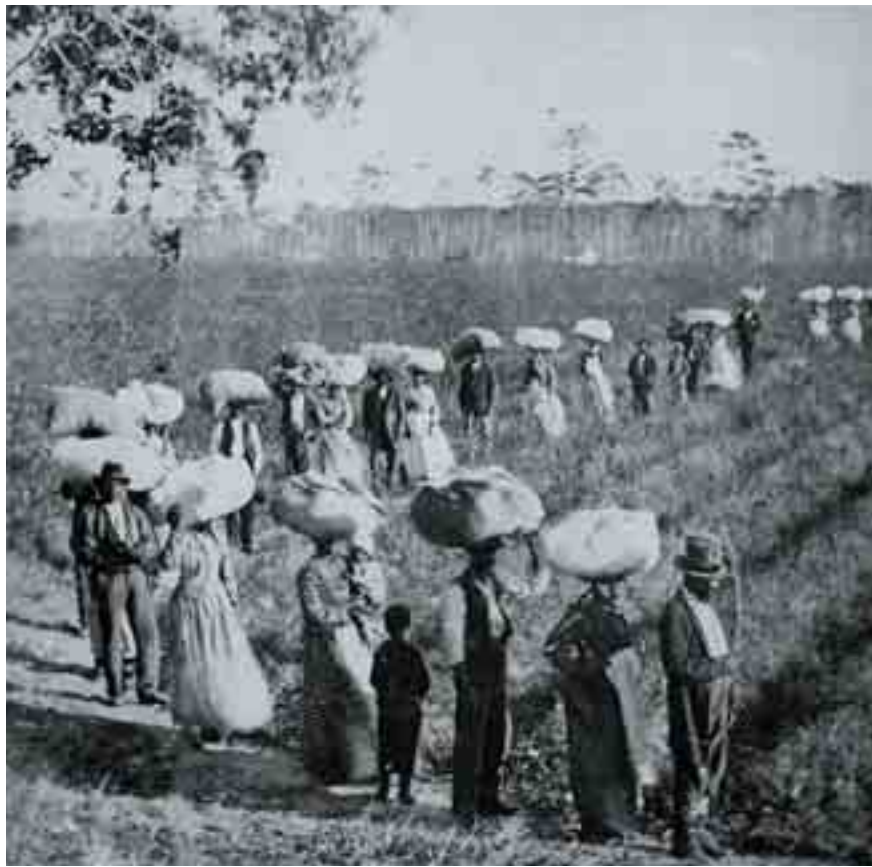
Slaves returning from a cotton field in the early 1860s

These same technologies have also produced an unprecedented natural gas surge, as fracking wells are sunk into the soil of ranches and parks and hillsides across the country. Pennsylvania's Marcellus Shale alone produces about 14 billion cubic feet of natural gas per day—the equivalent of more than 2.4 million barrels of oil. Shale